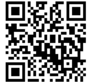
QR code 2

All responses must be received by 17:00 on Monday 19 May 2025