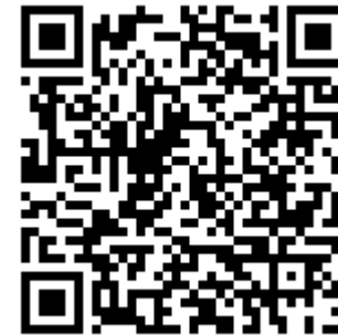
QR code 1

Development Strategy Team, Town Hall, Evreux Way Rugby CV21 2RR